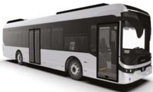
12.9m LE 2-DOOR