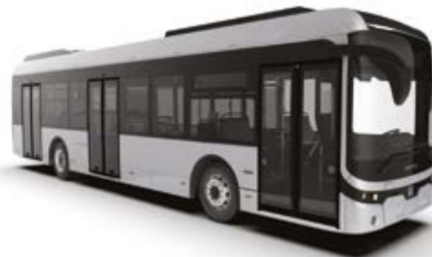
12m LF 2/3-DOOR